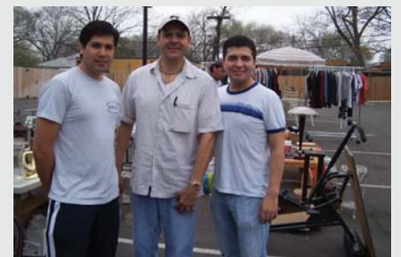
On March 11, Valiente held a six-hour yard sale at the John Thomas Gay and Lesbian Center. The group raised $462.10. V